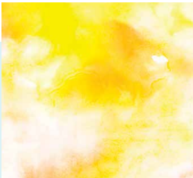
Alloment Azo Pigments