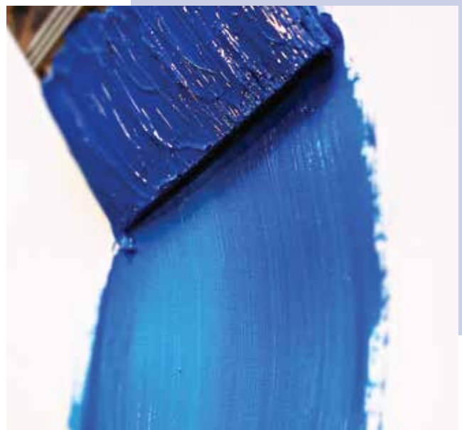
Alloment Phthalocyanine Pigments