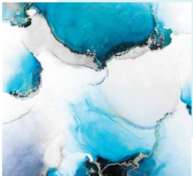
Alloment Phthalocyanine Pigments