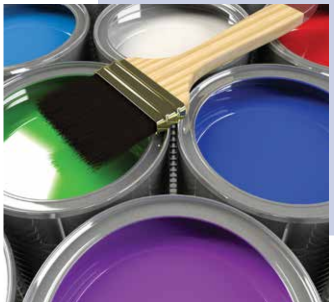
Alloment Phthalocyanine Pigments