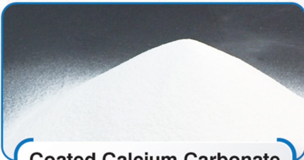
Coated Calcium Carbonate

Calcium carbonate with specialized coatings for improved performance.