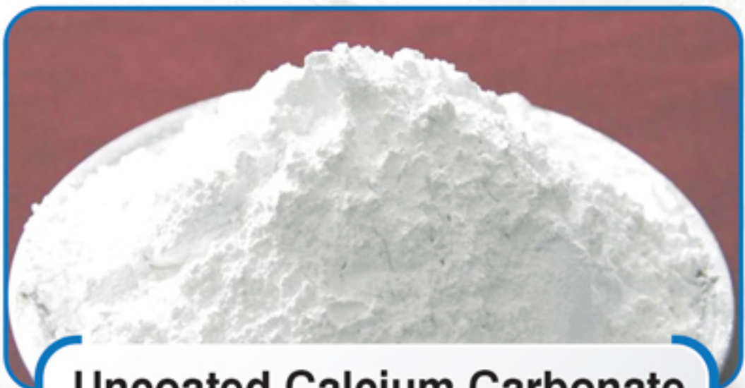
Uncoated Calcium Carbonate

Versatile and pure calcium carbonate for various applications.