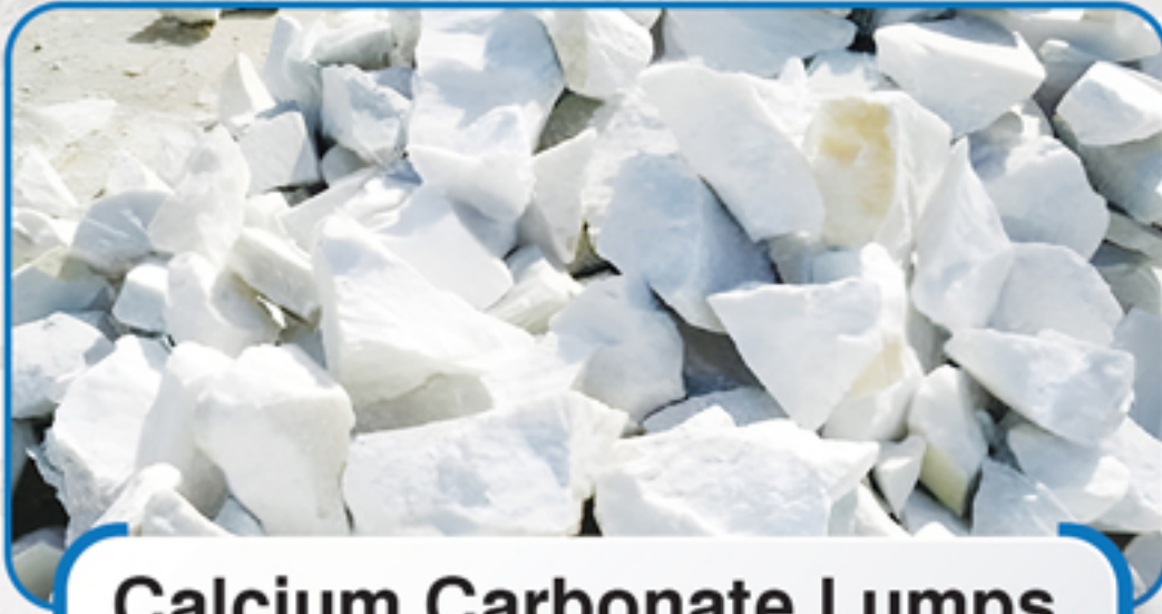
Calcium Carbonate Lumps